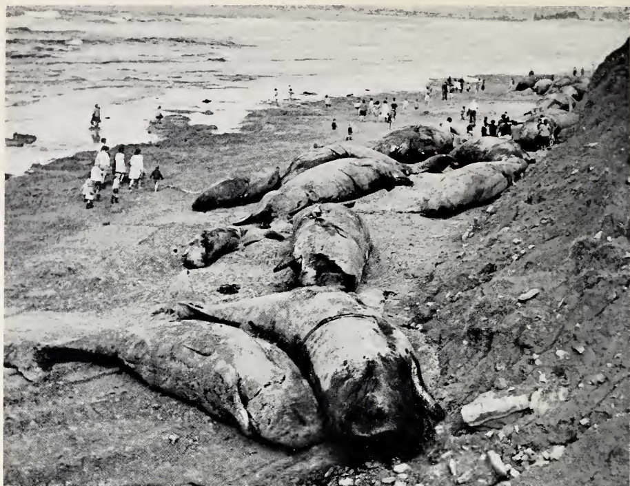
Fig. 2. Some of the Sperm Whales of the mass stranding near Gisborne after being pushed above the high water line.

mary slits showed the worst signs of infection. The condition of this animal was very poor and gave the impression that it would not survive very long. All the remainder were in excellent health. With the exception of three animals, which had scraped along the reef in their mad rush to the shore, none, showed any sign of recent injury. One specimen had at some time lost 18" (45.7 cm) off a tail fluke and another 9" (22.8 cm) off a flipper, but these injuries had healed perfectly and the skin had rejuvenated to the same lustre as that on the entire animal.